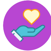
Inclusive Programming & Equitable Systems*